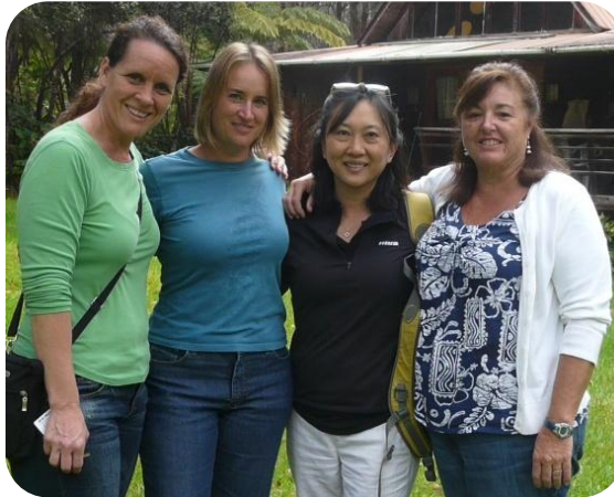
UofN Kona Simple Health Care team