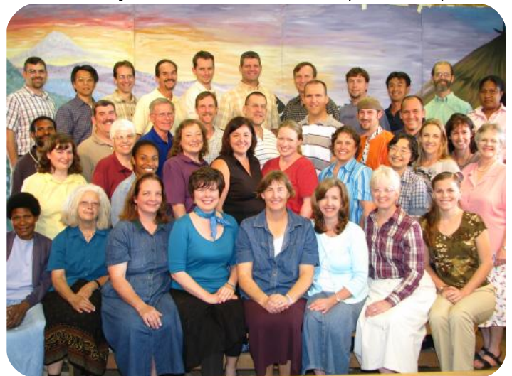
Ukarumpa International School Secondary Campus Faculty 2008