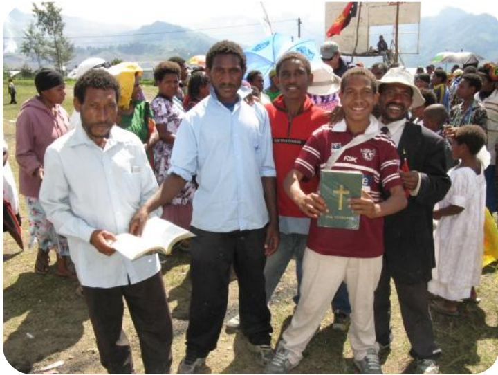
Ipili New Testament Dedication, August 2008.

Web: http://eBible.org/Johnson/ Home: +675 737-4614 B-Mobile: +675 671-0146 Digicel: +675 7218-2933 Skype: kahunapule or +1 719-387-7238