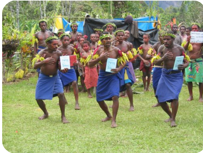
Dedication of a new HIV/AIDS awareness book translation.

It's estimated that 3% of PNG's 6 million people are presently infected with HIV. If present rising infection trends persist, 18% of the population could be affected by 2010, and 25% could be affected by 2020. That is why I've been a part of the SIL HIV/AIDS