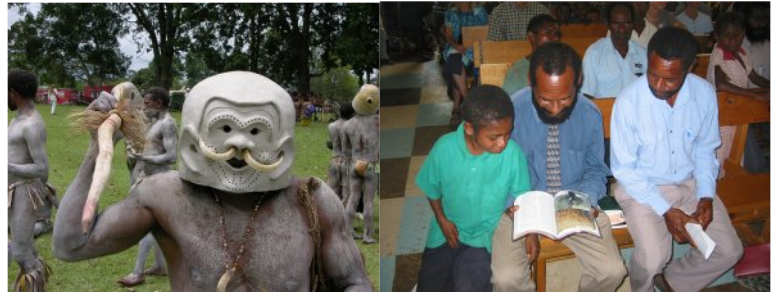
God's Word changes lives!