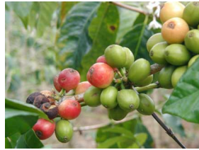
Coffee grows near our house in the highlands.*

We thought it would be good to give you more information about Papua New Guinea, the country we've been living in for about 2 years now. Papua New Guinea is made up of 19 provinces and a national capital district. There are many different kinds