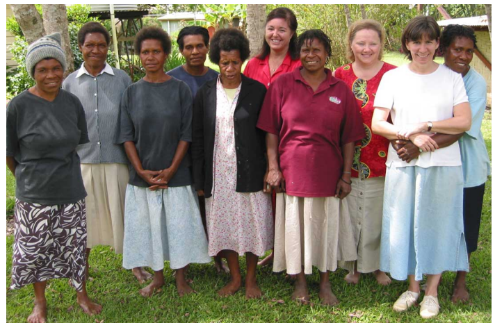
Women’s Bible Study members

As I am still learning the language. Please remember me in prayer as I lead these women to know Christ in a more intimate way.