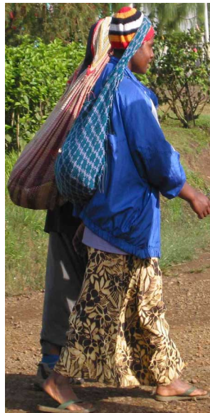
Women in PNG carry loads (food, firewood, or babies) in hand-made string-bags draped from their foreheads.

We are grateful to God and to you who keep making it possible for us to be here laboring to fulfill the Great Commission. We love you!