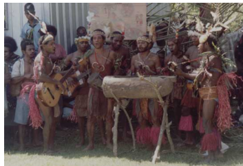
Lowlands musicians in traditional costumes

of cultures throughout the different parts of the country. We live in the highlands, which is, you guessed it, in the highlands of the country. There are many differences between the people here in the highlands and in the lowlands. Here the people were traditionally more aggressive while the people in the lowlands are more easy-going. People in the highlands get most of their money from selling coffee while people in the lowlands get money from selling cocoa or coconuts. Most people here in PNG still get most of their food from their gardens, but there are a variety of packaged foods that are commonly sold in the cities and villages here. There are beef crackers, which are a salty cracker similar to hardtack, two minute noodles, which are similar to Top Ramen noodles. Both here and in the lowlands, the main language spoken besides the many local languages is Tok Pisin.