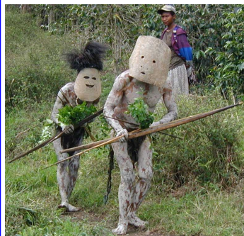
Highlands mudmen with bows and arrows*

of cultures throughout the different parts of the country. We live in the highlands, which is, you guessed it, in the highlands of the country. There are many differences between the people here in the highlands and in the lowlands. Here the people were traditionally more aggressive while the people in the lowlands are more easy-going. People in the highlands get most of their money from selling coffee while people in the lowlands get money from selling cocoa or coconuts. Most people here in PNG still get most of their food from their gardens, but there are a variety of packaged foods that are commonly sold in the cities and villages here. There are beef crackers, which are a salty cracker similar to hardtack, two minute noodles, which are similar to Top Ramen noodles. Both here and in the lowlands, the main language spoken besides the many local languages is Tok Pisin.